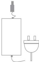
Power Supply x 1