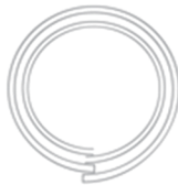
PE Tube x 2